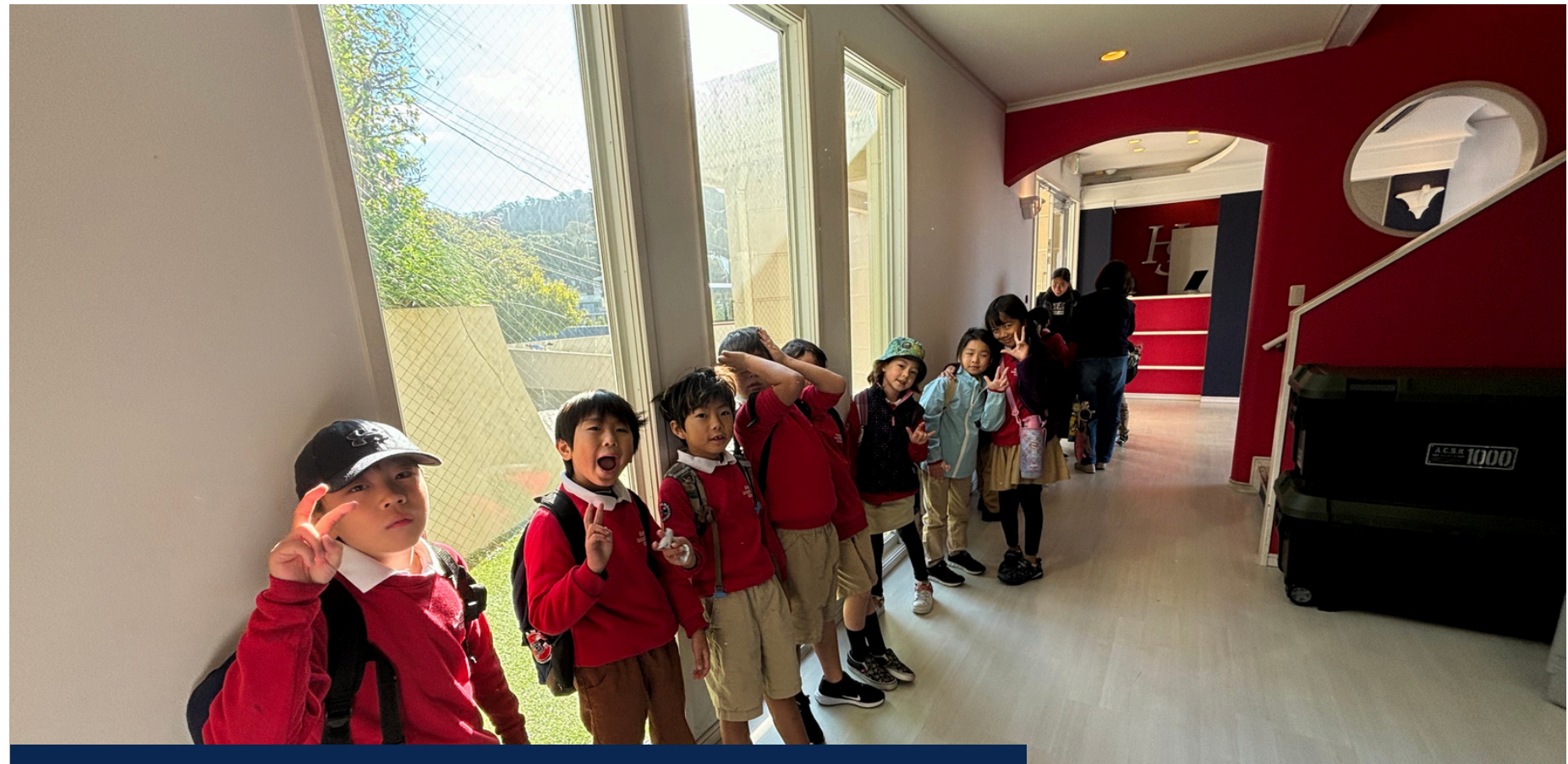
OUR FIELDTRIP 2024