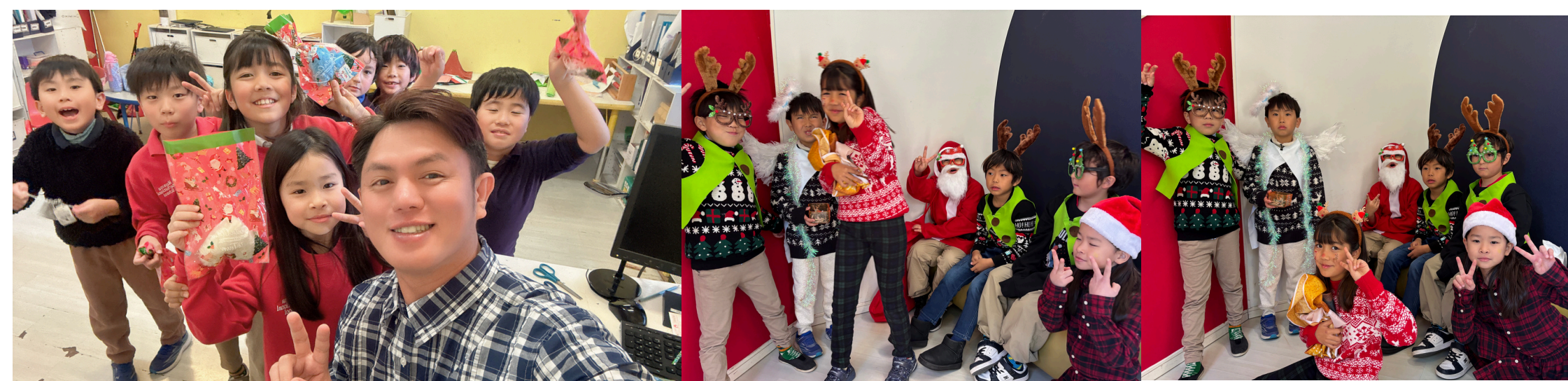
HOLIDAY PARTY 2024