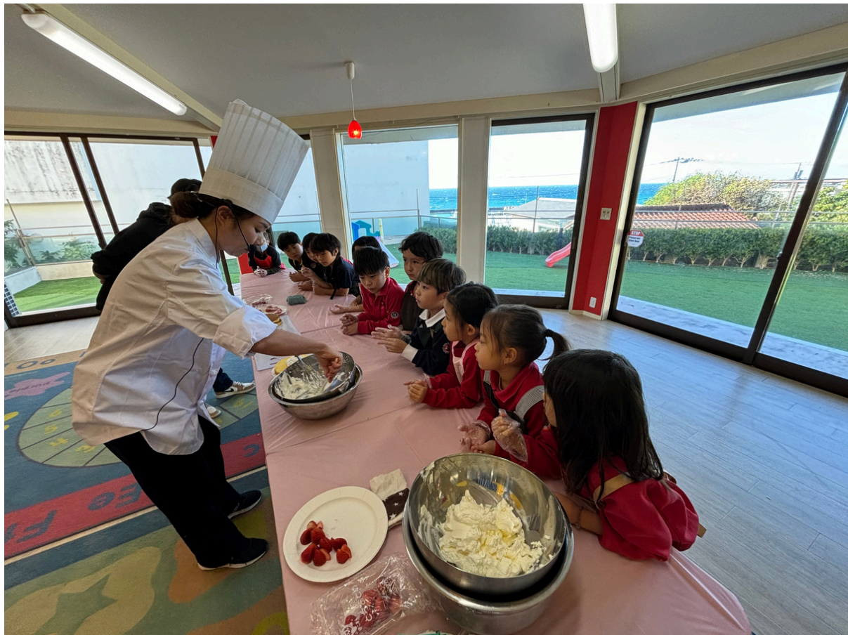
MEET THE PATTISIER