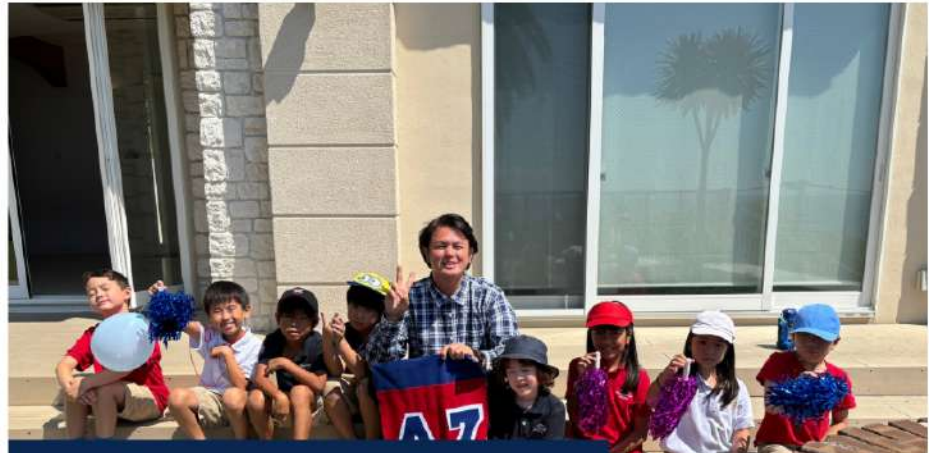
1ST CLASS PICTURE