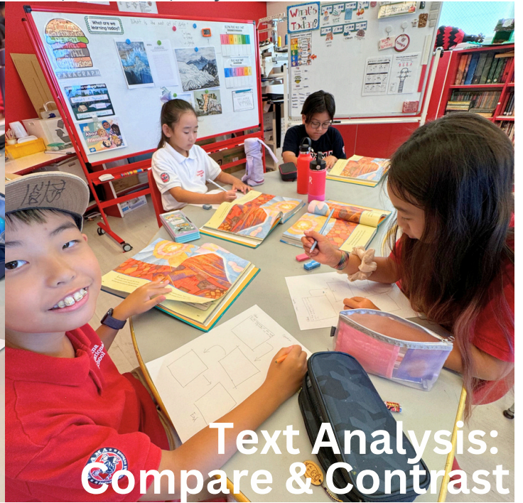
Text Analysis: Compare & Contrast